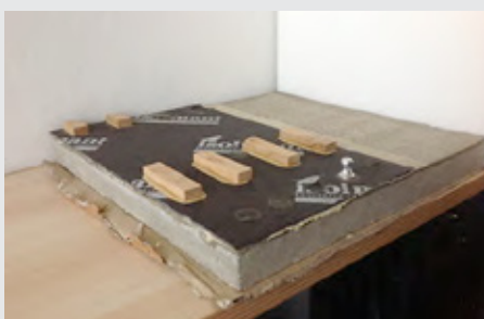
B) Samples for shear test on glued wooden flooring and samples for pull-up test ("test dolly")