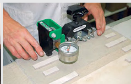
C) Shear test by means of proper instrumentation (Pressure meter - shearing hydraulic meter)

WARNING: This technical data sheet is not a valid specification and, if it consist of multiple pages, be sure to read the full document. This instruction are the best of our current experience but are indicative information. Assuming the liability resulting from the use of this product, it is up to the user to establish whether the product is suitable for the intended use.